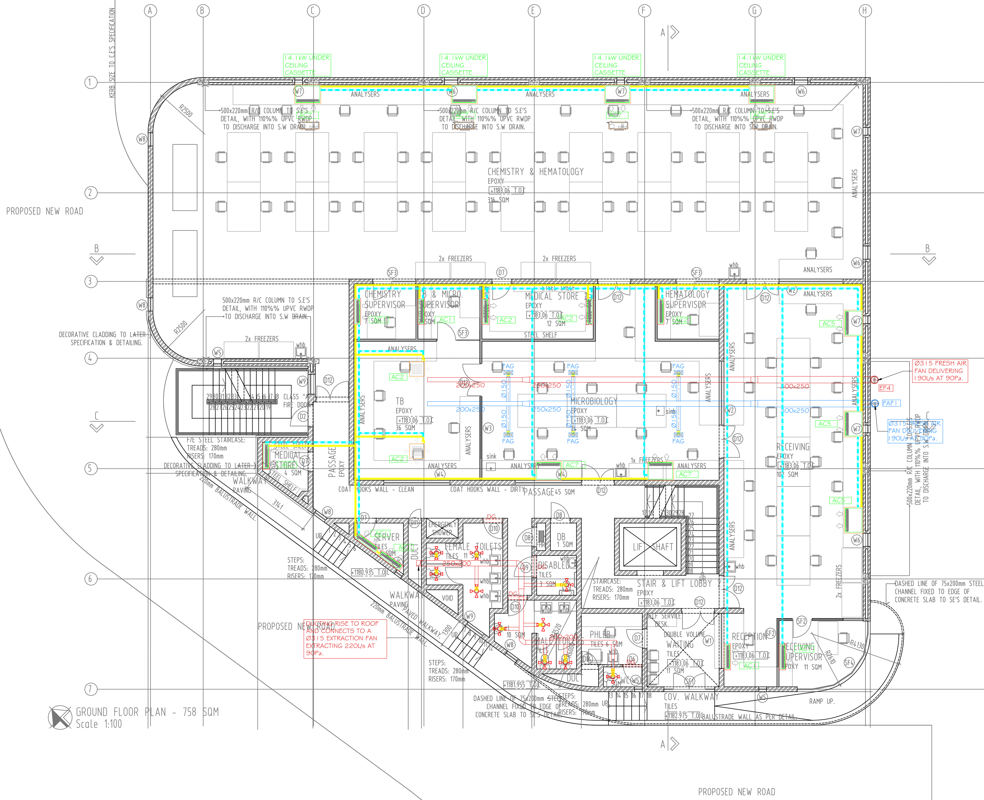
GROUND FLOOR PLAN - 758 SQM Scale 1:100